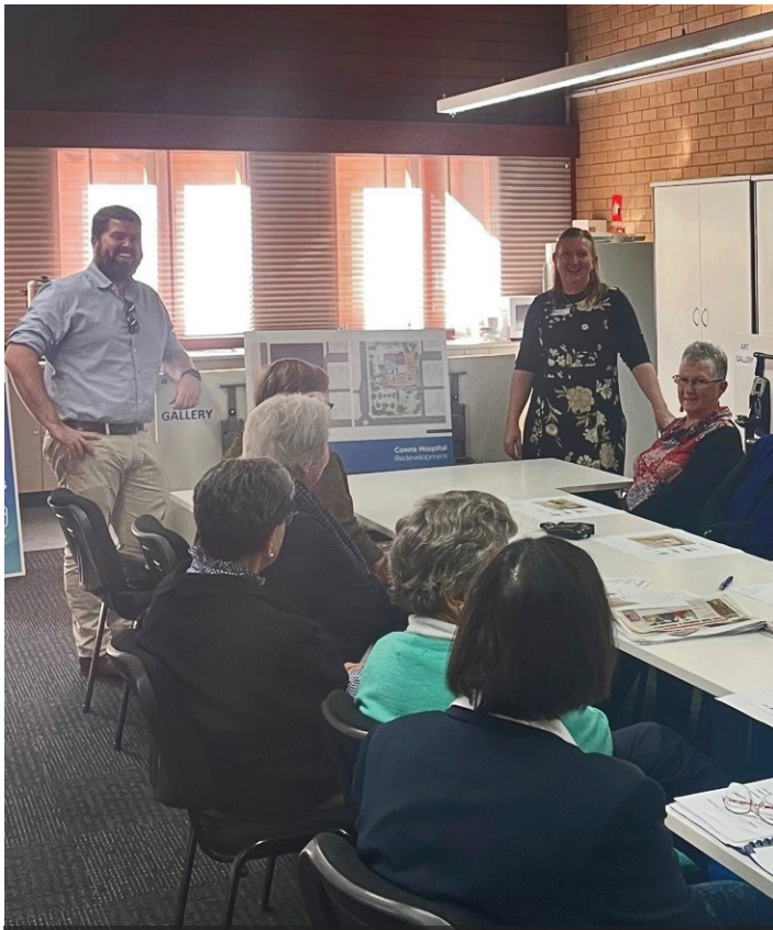
THE PROJECT TEAM PRESENTING TO A LOCAL COMMUNITY GROUP