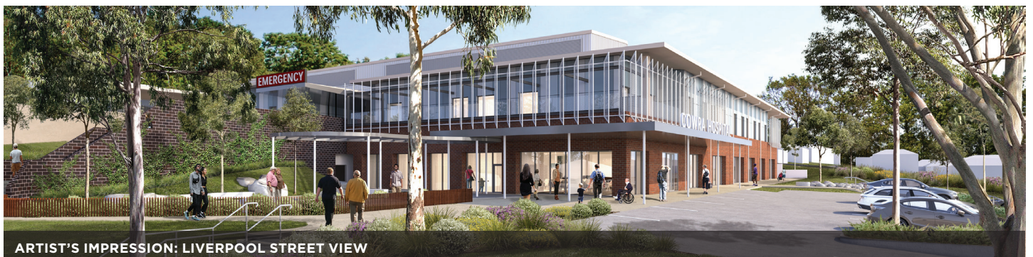
ARTIST'S IMPRESSION: LIVERPOOL STREET VIEW

To view the internal site plans for the $110.2 million Cowra Hospital, please visit the project website .