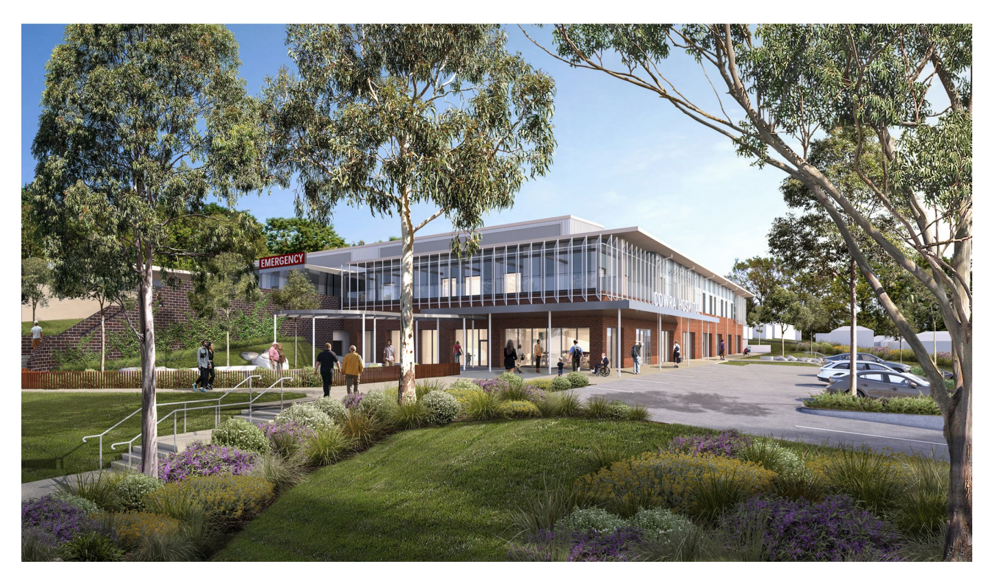
Above: Schematic design artist impression for the new Cowra Hospital