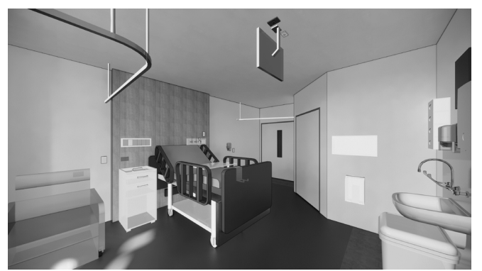
Above: Artist impression of the single inpatient room.

Health Infrastructure and Western NSW Local Health District (WNSWLHD) have been working together to finalise plans for the redevelopment ahead of main works construction starting early next year.