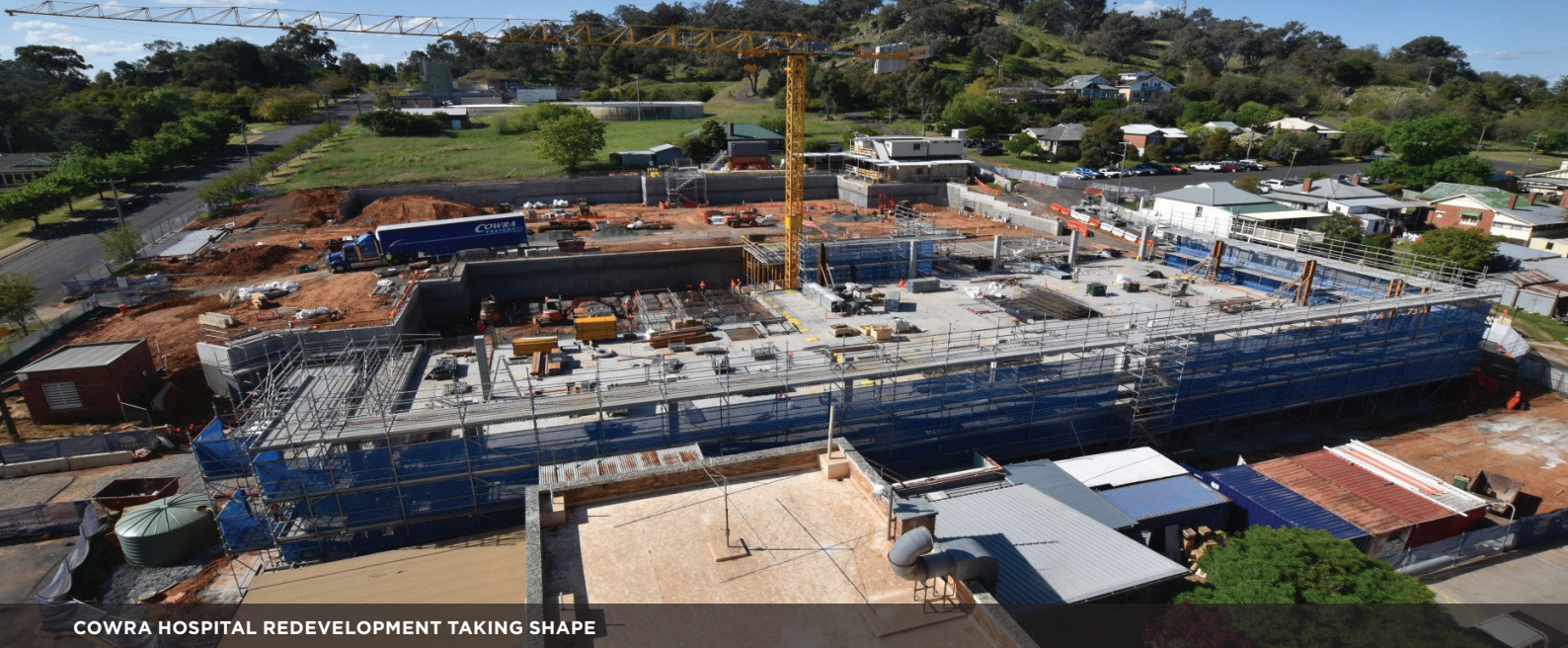
COWRA HOSPITAL REDEVELOPMENT TAKING SHAPE

The $110.2 million Cowra Hospital Redevelopment will transform the delivery of healthcare for the Cowra community, delivering high-quality contemporary and accessible care close to home.